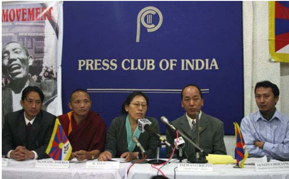
Presidents of five organizations at the press conference in New Delhi on 4th January.

New Delhi, January 4: Exiled Tibetans led by five organizations have announced a plan to take a major protest march from India to Tibet demanding China for the peaceful resolution of Tibet issue ahead of the 2008 Beijing Olympics.